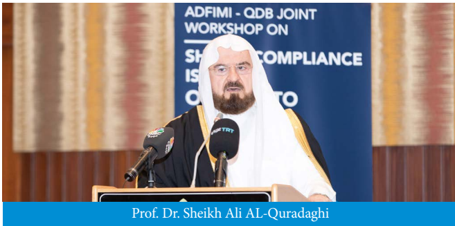
Prof. Dr. Sheikh Ali AL-Quradaghi

in the light of Islamic rulings. On the Shariah perspective on cryptocurrencies, he said, there were some Sharia's alternatives intended to regulate the Digital Cryptocurrencies system including government guarantee, or backing them up with assets. As such, any transactions in that field would be permissible (mubah) unless there was a clear evidence on its prohibition.