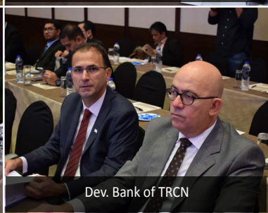
Dev. Bank of TRCN