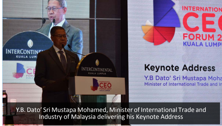
Y.B. Dato' Sri Mustapa Mohamed, Minister of International Trade and Industry of Malaysia delivering his Keynote Address