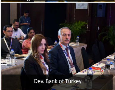
Dev. Bank of Turkey