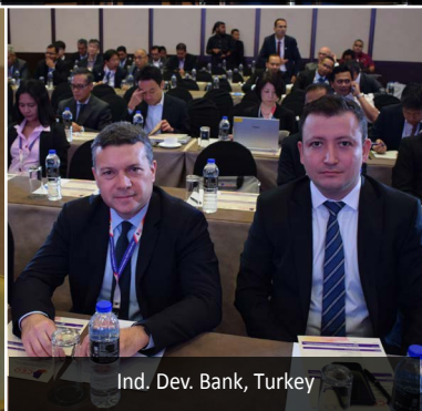
Ind. Dev. Bank, Turkey