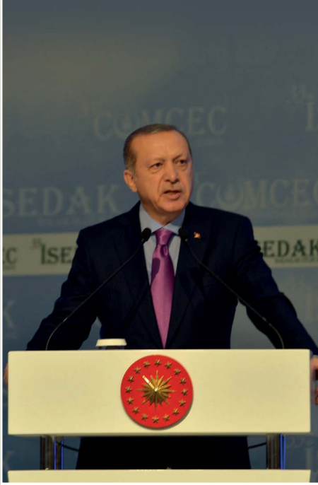
H.E. Recep Tayyip Erdoğan, President of Turkey Chairman of COMCEC, delivering his Inaugural Address