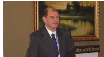
Mr. H. Cevdet Yılmaz