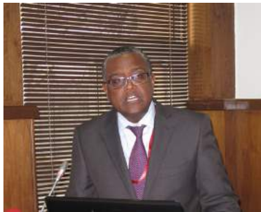
H.E. Omar Mitha, Vice Minister of Industry and Trade, Mozambique