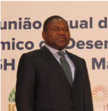
H.E. Filipe Nyusi, President of the Republic of Mozambique

They teach our states and institutions lessons that can be showcased in the international dialogue preceding the adoption of development goals in New York next autumn. Of those lessons I want to particularly mention building of the economy on three pillars: