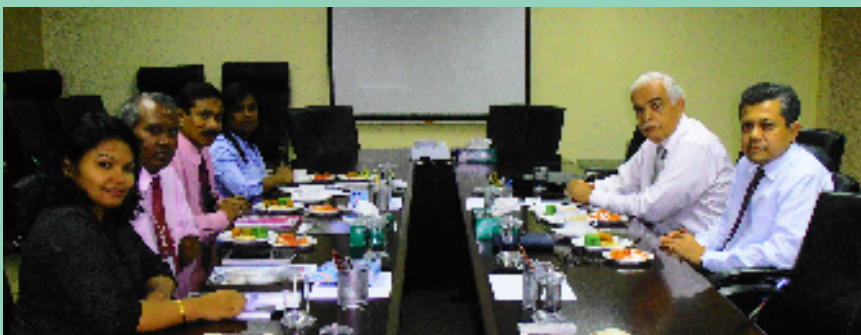
Maldives Monetary Authority HQ

ADFIMI visited Maldives Monetary Authority and Maldives Islamic Bank.