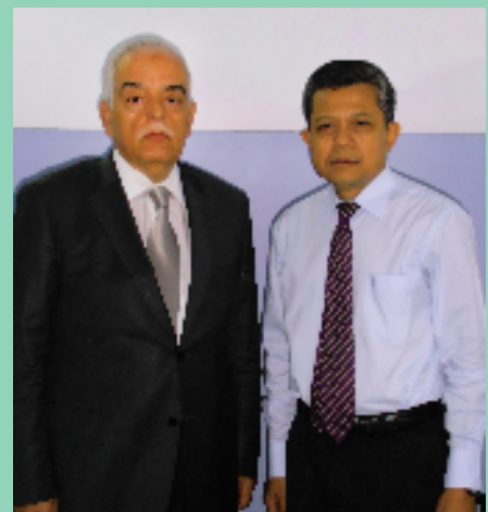
Maldives Islamic Bank