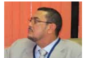
ADFIMI visited member and non-member institutions in Sudan.