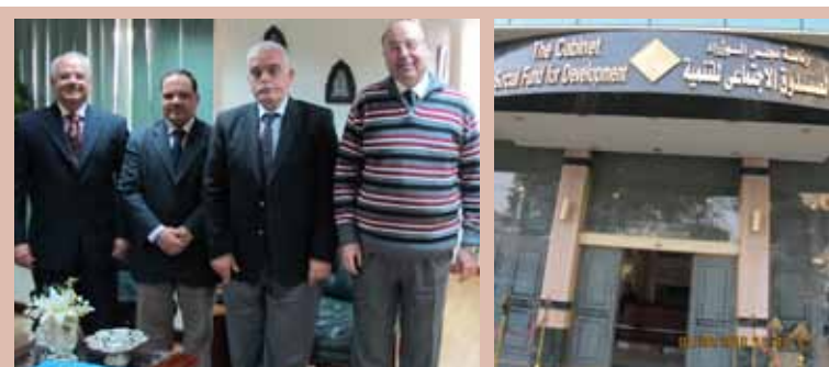
ADFIMI visited the Social Fund in Egypt.

The IDB approved USD120 million loan to participate in the Islamic financing facility for Jubail Refinery and Petrochemical Project, considered to be one of the most strategic projects for Saudi Arabia.